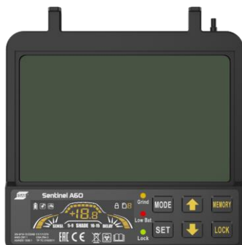
Advanced CE 1/1/1/1 ADF technology with a simple interface and clear graphic display.