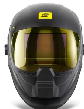
Compact shell with optional amber-colored protective outer lens.