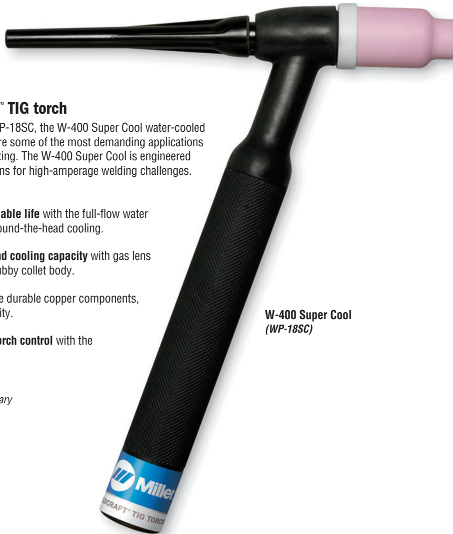
W-400 Super Cool (WP-18SC)