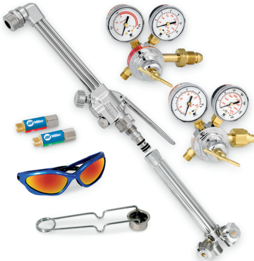
Toughcut Select CGA510 combo pack shown.