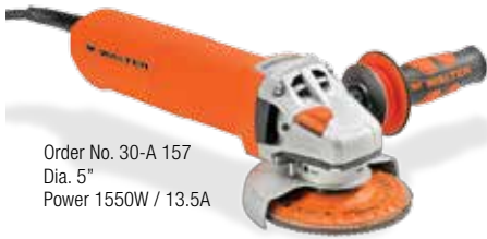
Order No. 30-A 157 Dia. 5" Power 1550W / 13.5A

The most powerful and heavy-duty small angle grinders available today. When paired with Walter abrasives they make the most productive combination on the market. See productivity gains of up to 100% in different applications.