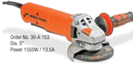
Order No. 30-A 153 Dia. 5" Power 1550W / 13.5A

MINI-PS™ Model 6163A Safety, portability and convenience