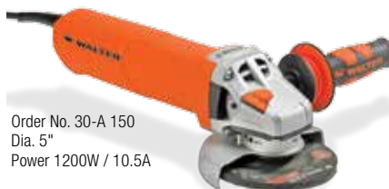
Order No. 30-A 150 Dia. 5" Power 1200W / 10.5A