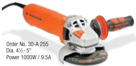
Order No. 30-A 255 Dia. 4 1/2 - 5" Power 1000W / 9.5A