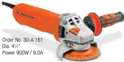
Order No. 30-A 161 Dia. 4 1/2" Power 900W / 9.0A

Perfect for all of your cutting, grinding, blending and sanding needs. Designed for 4.5" and 5" wheels. When paired with Walter abrasives you have the most powerful combination available.