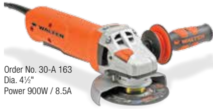
Order No. 30-A 163 Dia. 4½" Power 900W / 8.5A

Equipped with a paddle switch for maximum safety, these grinders will shut off when the switch is released. The BIG 6-PS™ features a 2-second mechanical stop – guaranteeing the safest working conditions possible with no compromise on power.