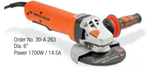
Order No. 30-A 263 Dia. 6" Power 1700W / 14.5A

SUPER 5-PS™ Model 6153A Safety and performance