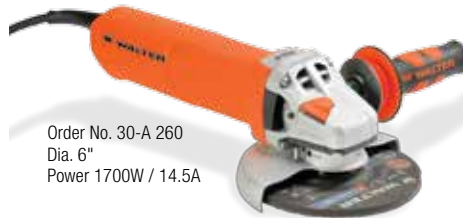
Order No. 30-A 260 Dia. 6" Power 1700W / 14.5A

PRO 5™ Model 6157A Ultra-efficient, comfortable and ideal for lengthy usage