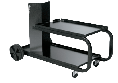
Small Running Gear/Cylinder Rack 194776

Comes in 8 ft. (2.4 m) length with liner for .030-.035 in. (0.8-0.9 mm) diameter wire.