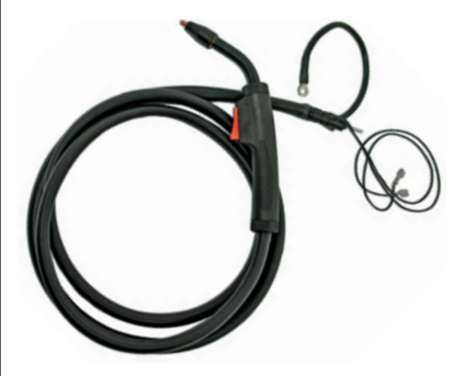
H100F2-8 Replacement Welding Gun Hobart/Miller 270629

Comes in 8 ft. (2.4 m) length with liner for .030-.035 in. (0.8-0.9 mm) diameter wire.