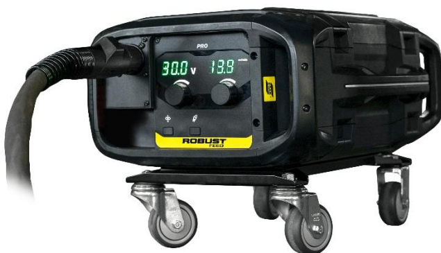
Wheel Kit works with feeder horizontal or vertical