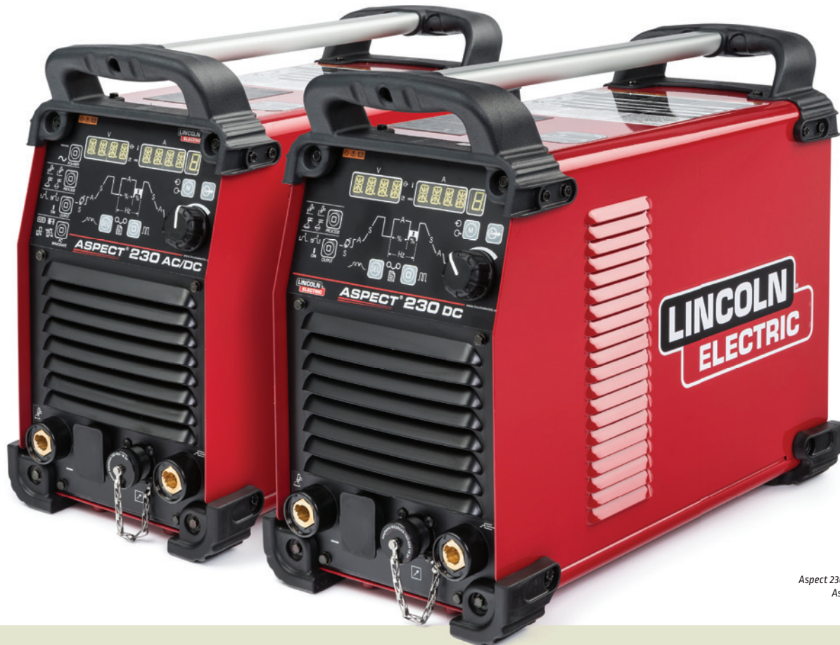
Shown: Aspect 230 AC/DC (K4340-1) and Aspect 230 DC (K4346-1)

THE CONSISTENCY YOU WANT, THE PERFORMANCE YOU NEED.