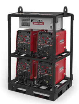
K3402-1 Flextec 350X Construction 4-Pack Rack K3403-1 Flextec 350X Standard 4-Pack Rack K4726-1 Flextec 350X PowerConnect<sup>®</sup> 4-Pack Rack