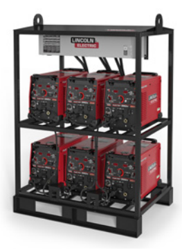
K4277-1 Flextec 350X Construction 6-Pack Rack K4281-1 Flextec 350X Standard 6-Pack Rack K4727-1 Flextec 350X PowerConnect® 6-Pack Rack K4465-1 Flextec 500X 6-Pack Rack