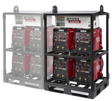
K3410-1 Expandable to 8-Pack Rack (shown with Flextec 350X 4-Pack to 8-Pack Rack Conversion Kit [K3410-1] )