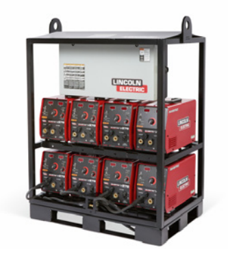
K4869-2 Invertec V276 8-Pack Rack

^{\mbox{\scriptsize fl}} Fork access configuration varies by rack model