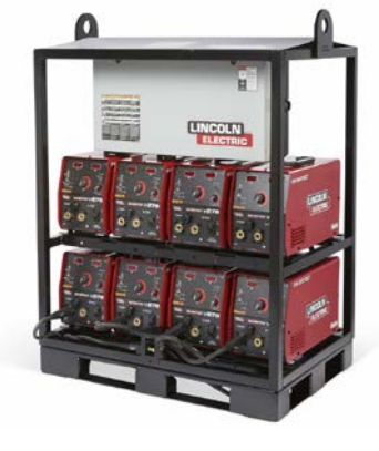
K4869-2 Invertec V276 8-Pack Rack