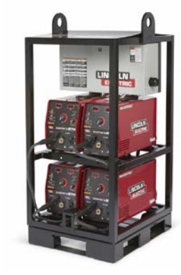
K4869-1 Invertec V276 4-Pack Rack