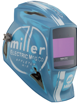
Vintage Roadster™ 281004