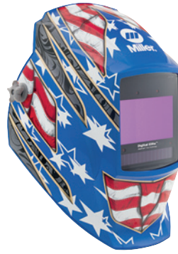
Stars and Stripes™ III 281002