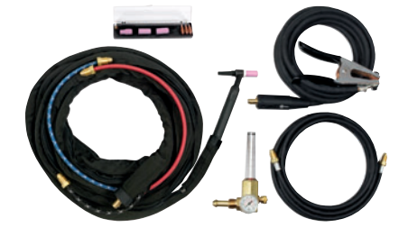
300990 kit shown.