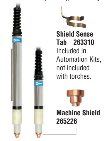
Note: The XT60M consumables are the same as the XT60 consumables, except for the machine shield.

XT60M Machine Torch 249955 25 ft. (7.6 m), long body 249956 50 ft. (15.2 m), long body 257464 25 ft. (7.6 m), short body 263952 50 ft. (15.2 m), short body